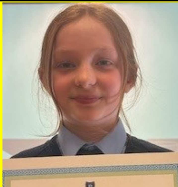
CONGRATULATIONS WILLOW SCHOOL COUNCIL AWARD