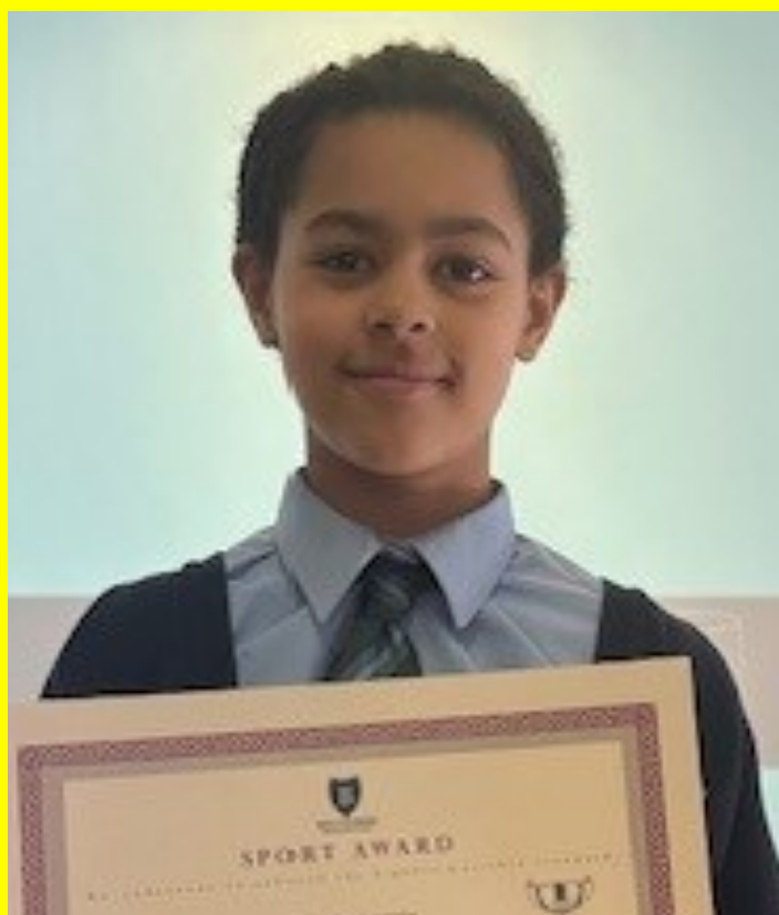
CONGRATULATIONS AMARA SPORT AWARD